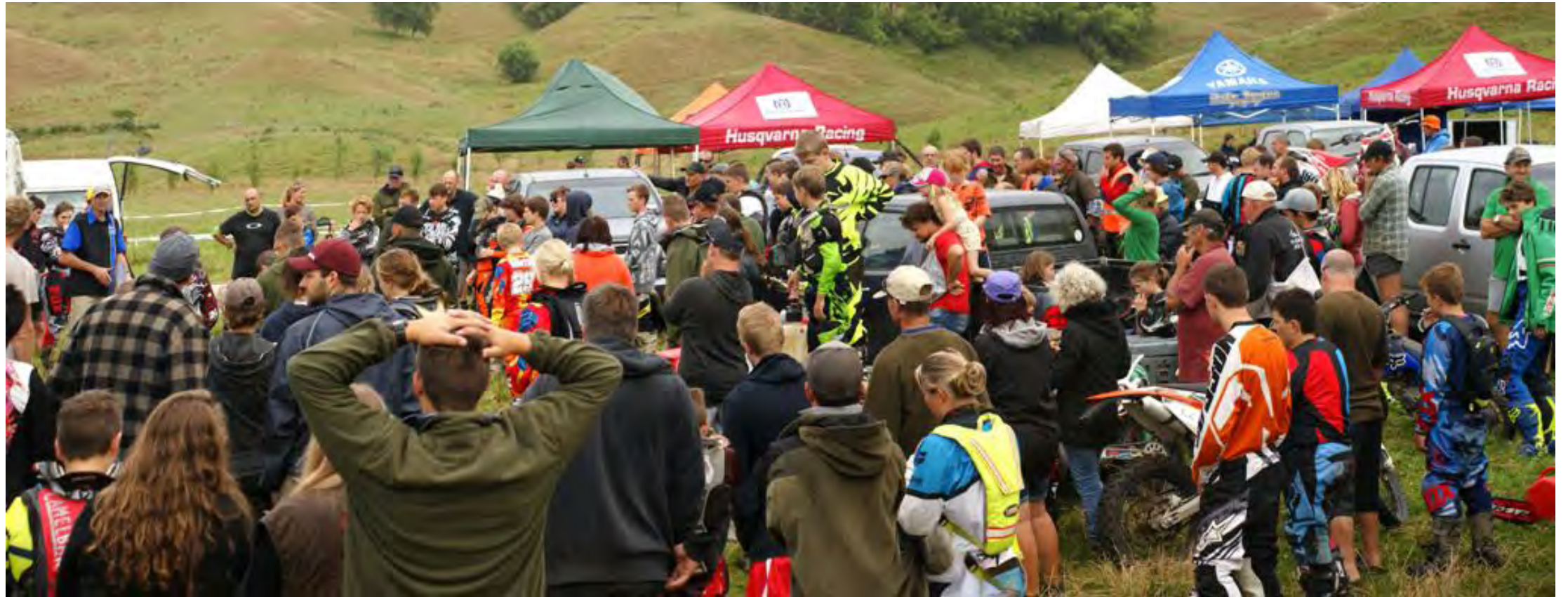
Summary Point 35