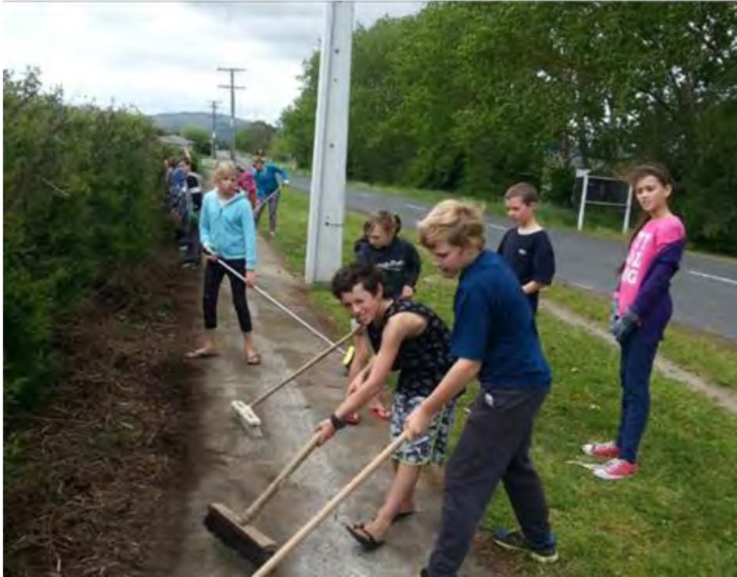
Summary Point 36.3