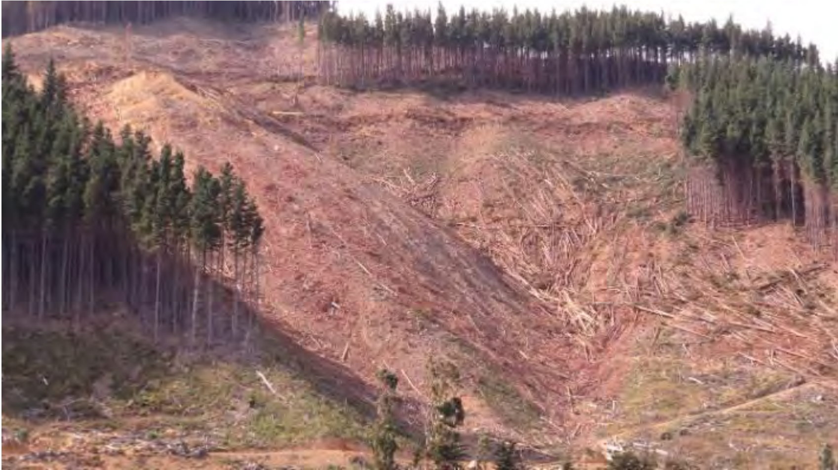
Summary Point 44