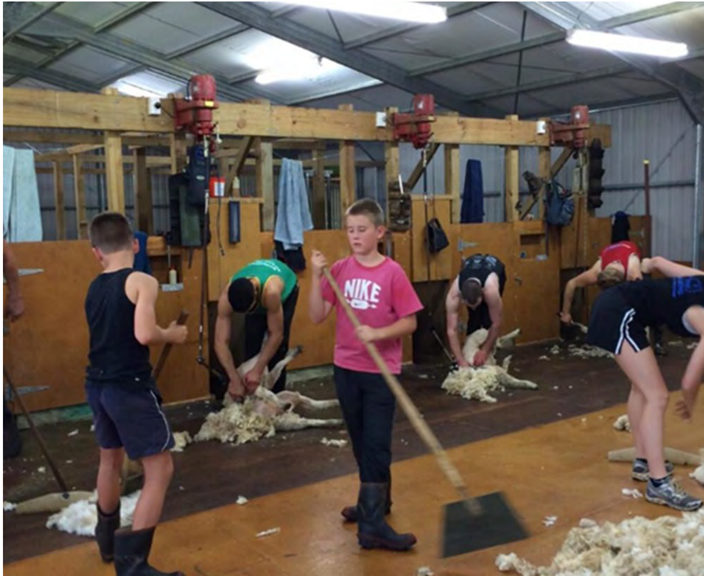
Summary Point 36.1