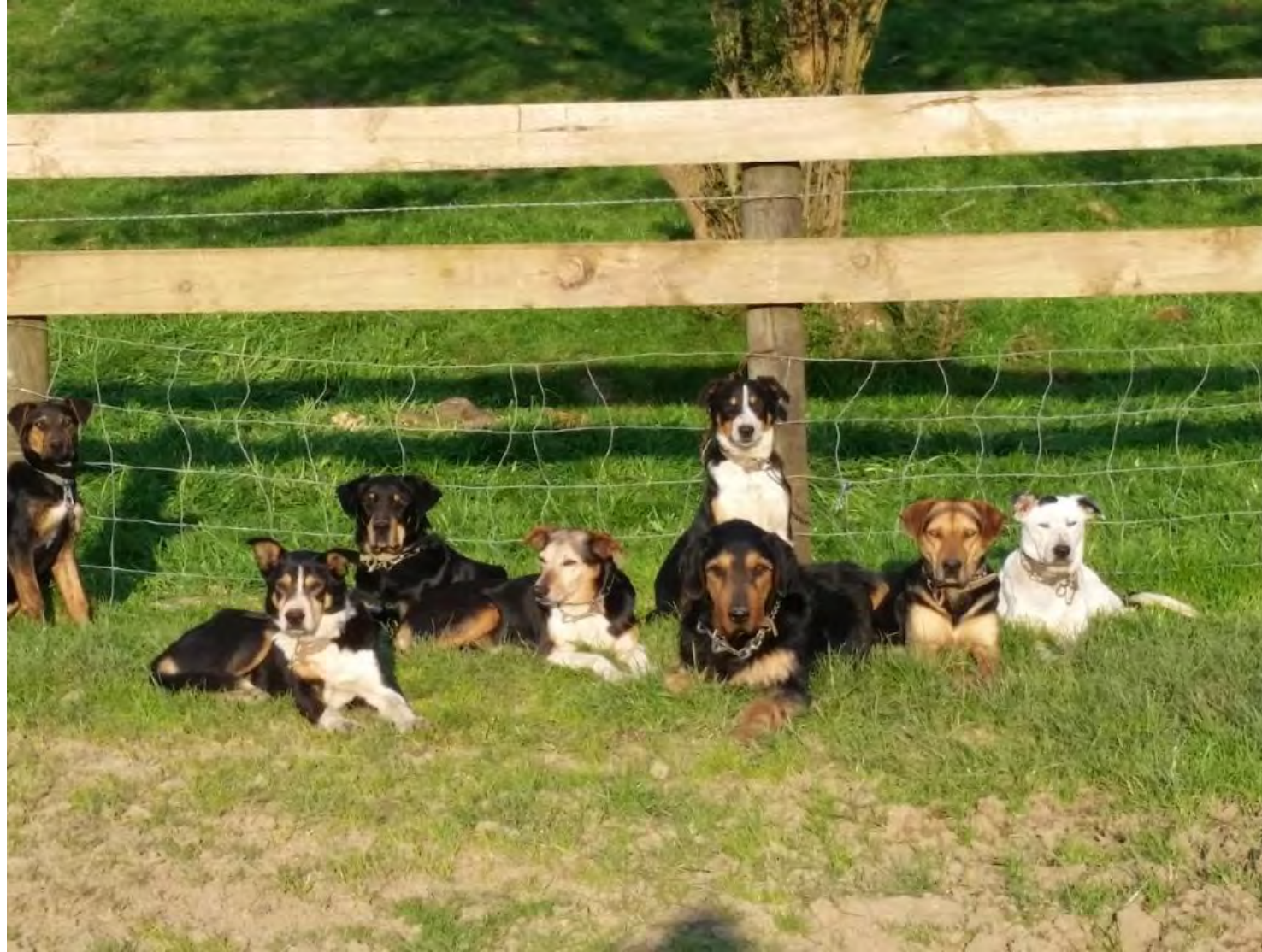
Summary Point 35