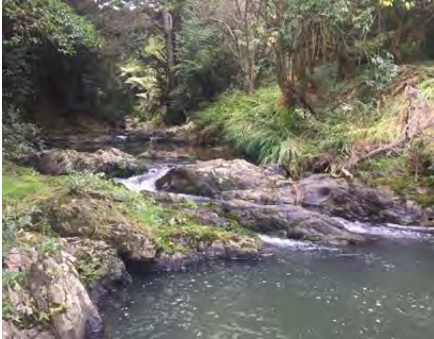
Summary Point 34