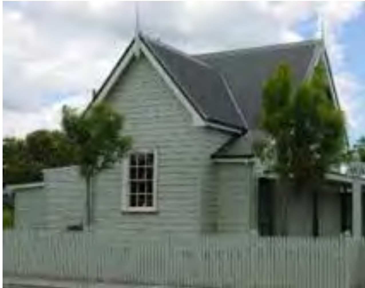
Summary Point 36.2