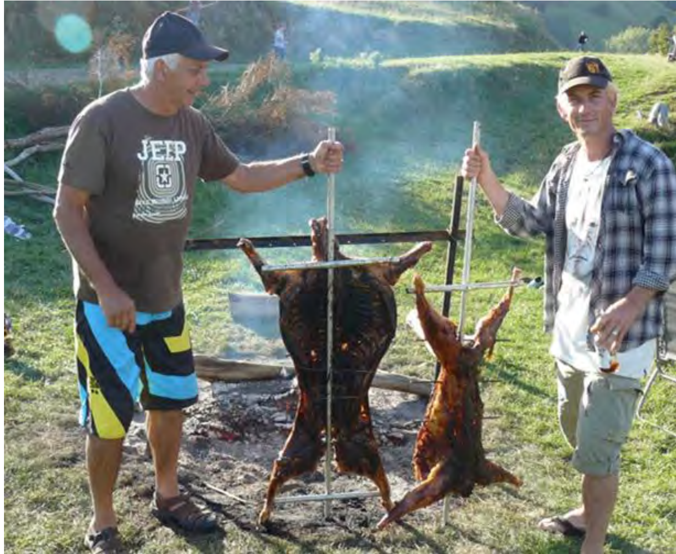
Summary Point 35