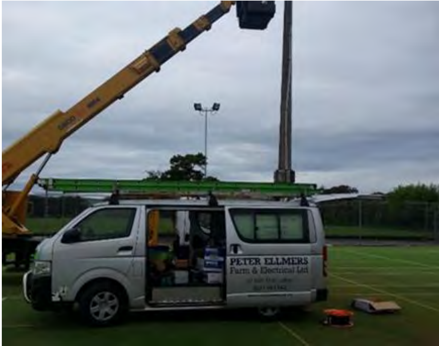
Summary Point 38