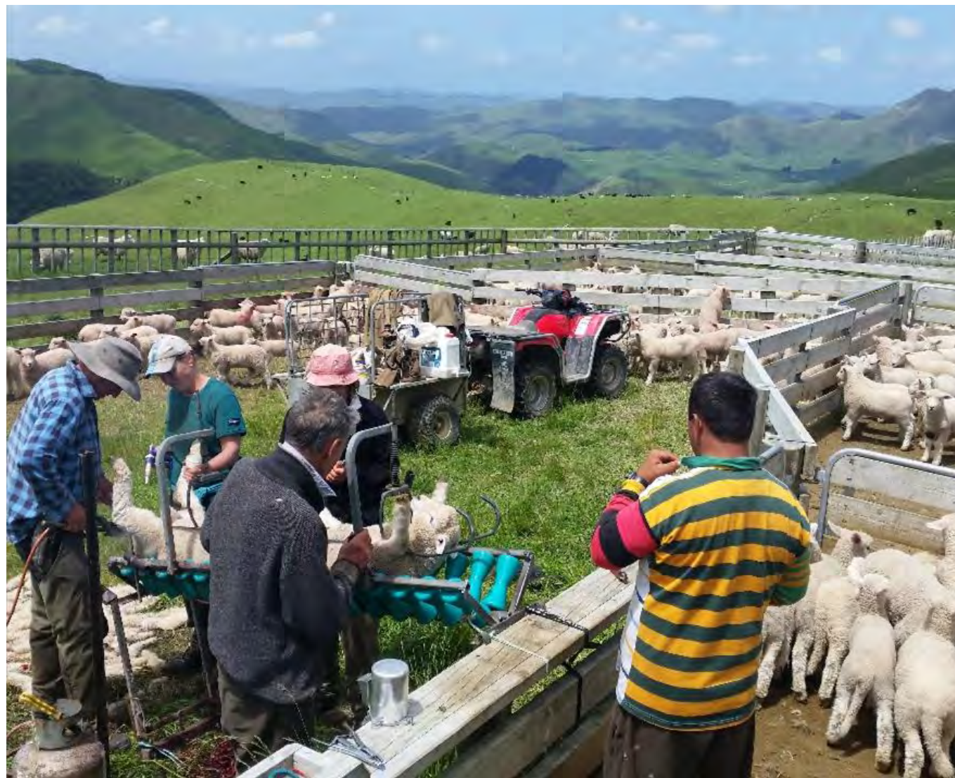
Summary Point 38