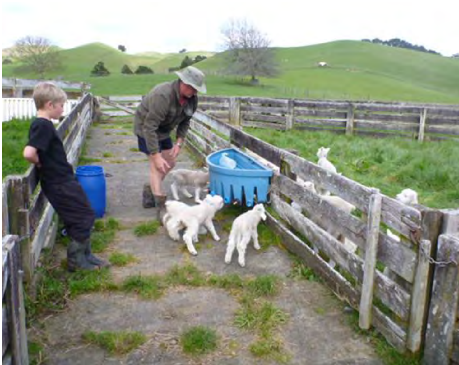
Summary Point 34.1