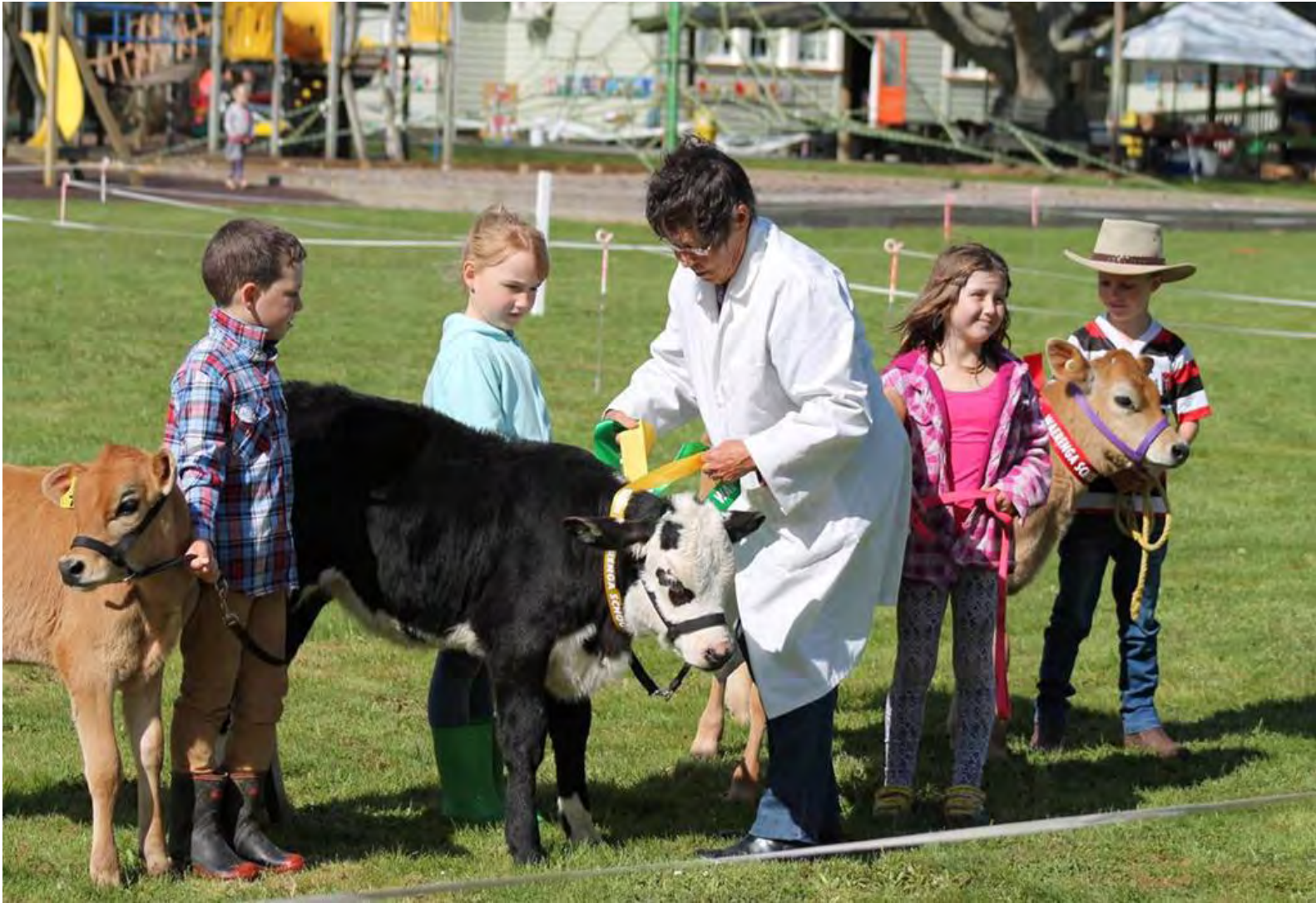
Summary Point 35