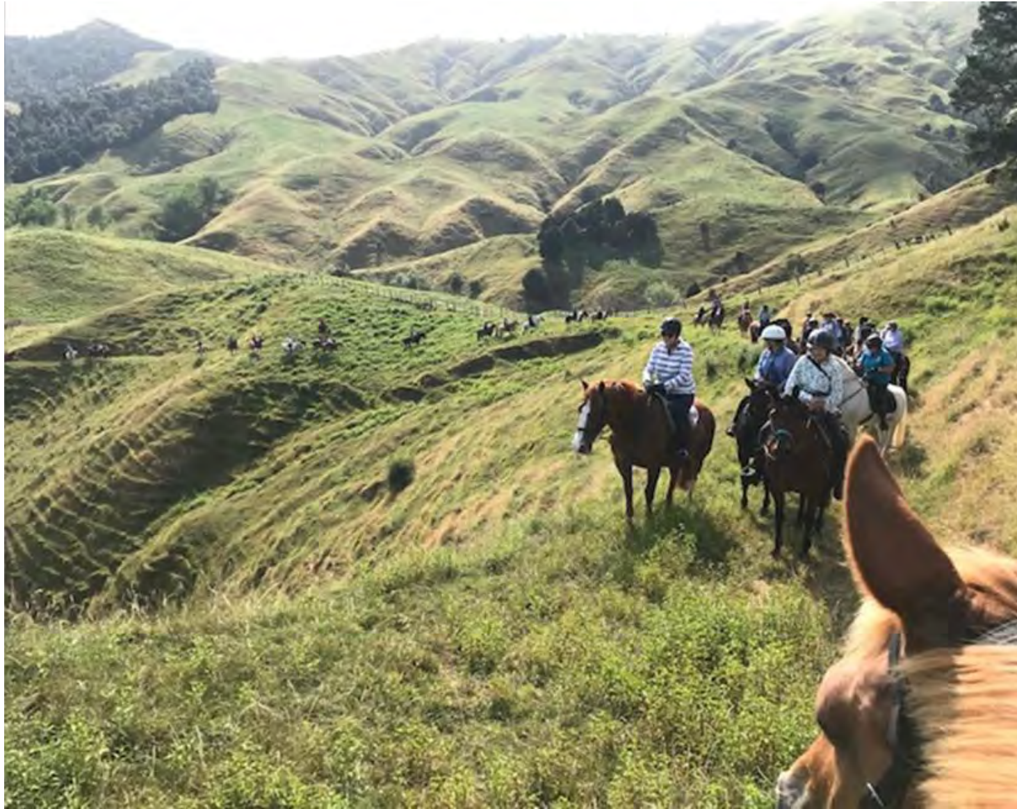
Summary Point 35