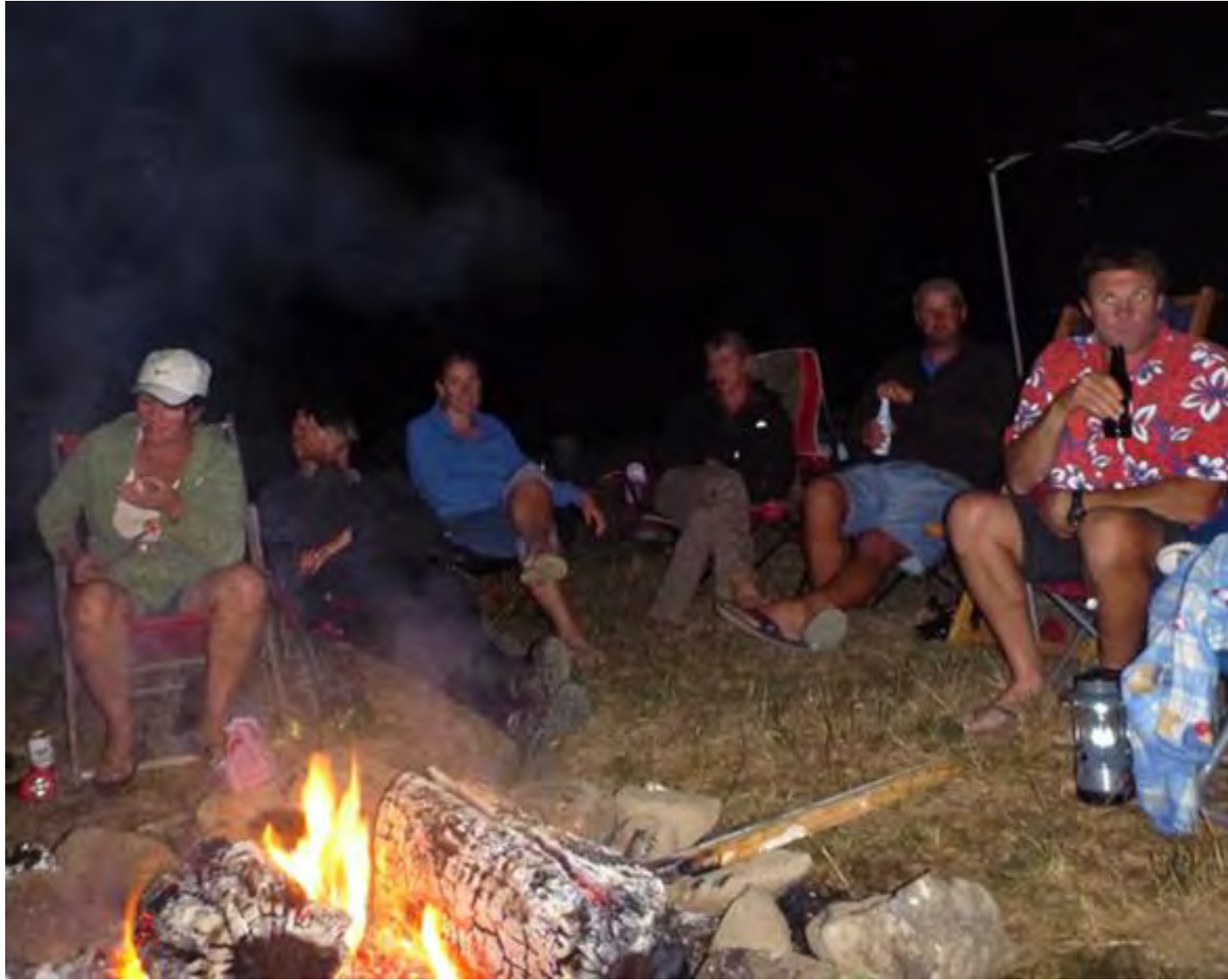
Summary Point 35