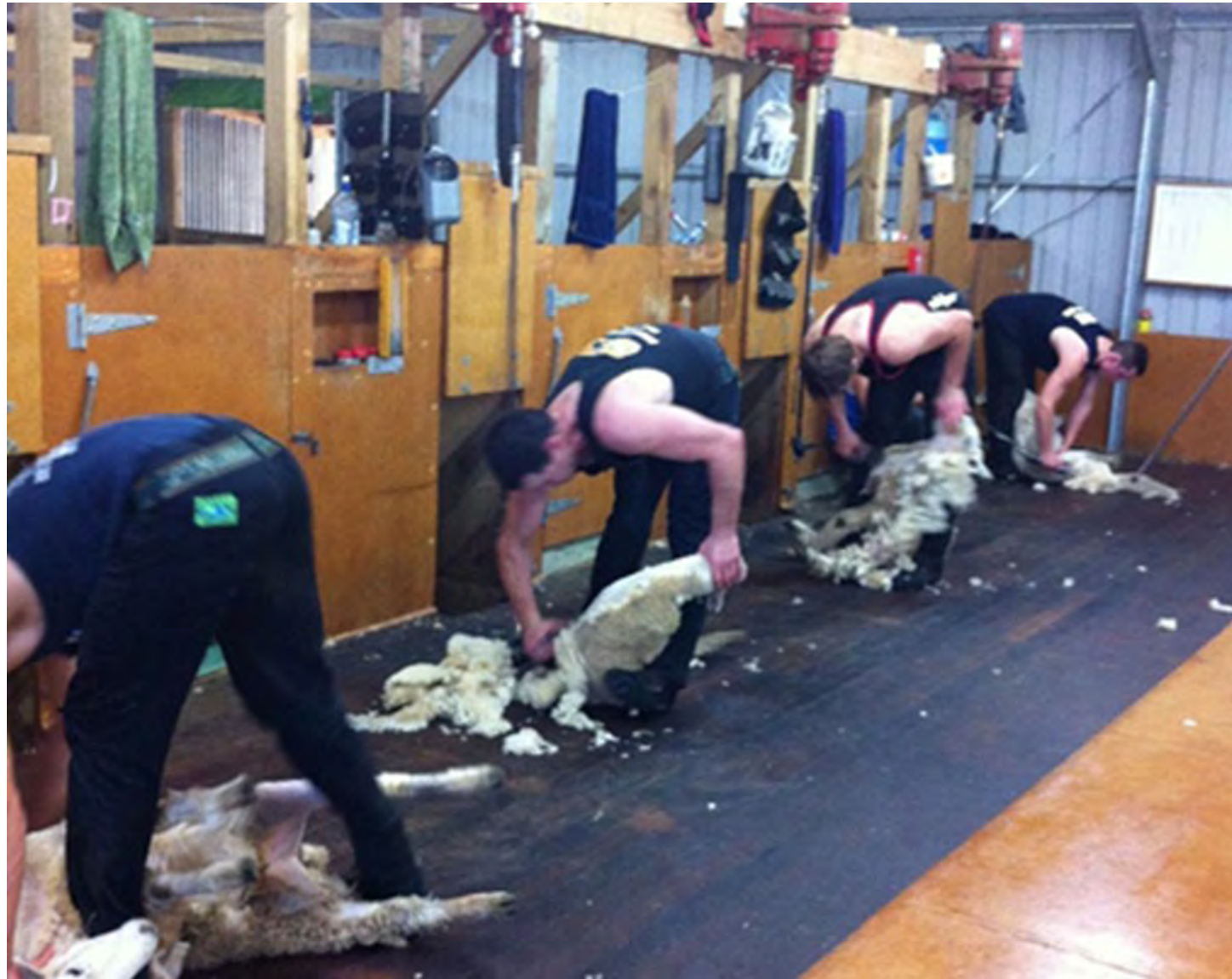
Summary Point 38