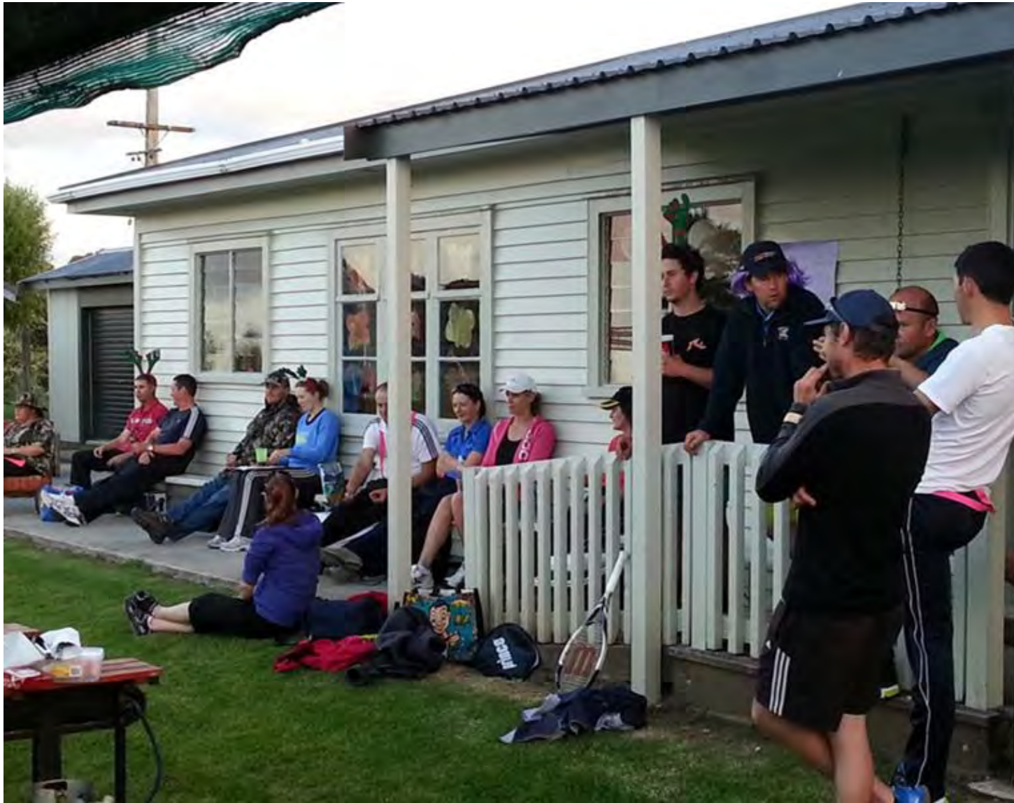
Summary Point 37.3