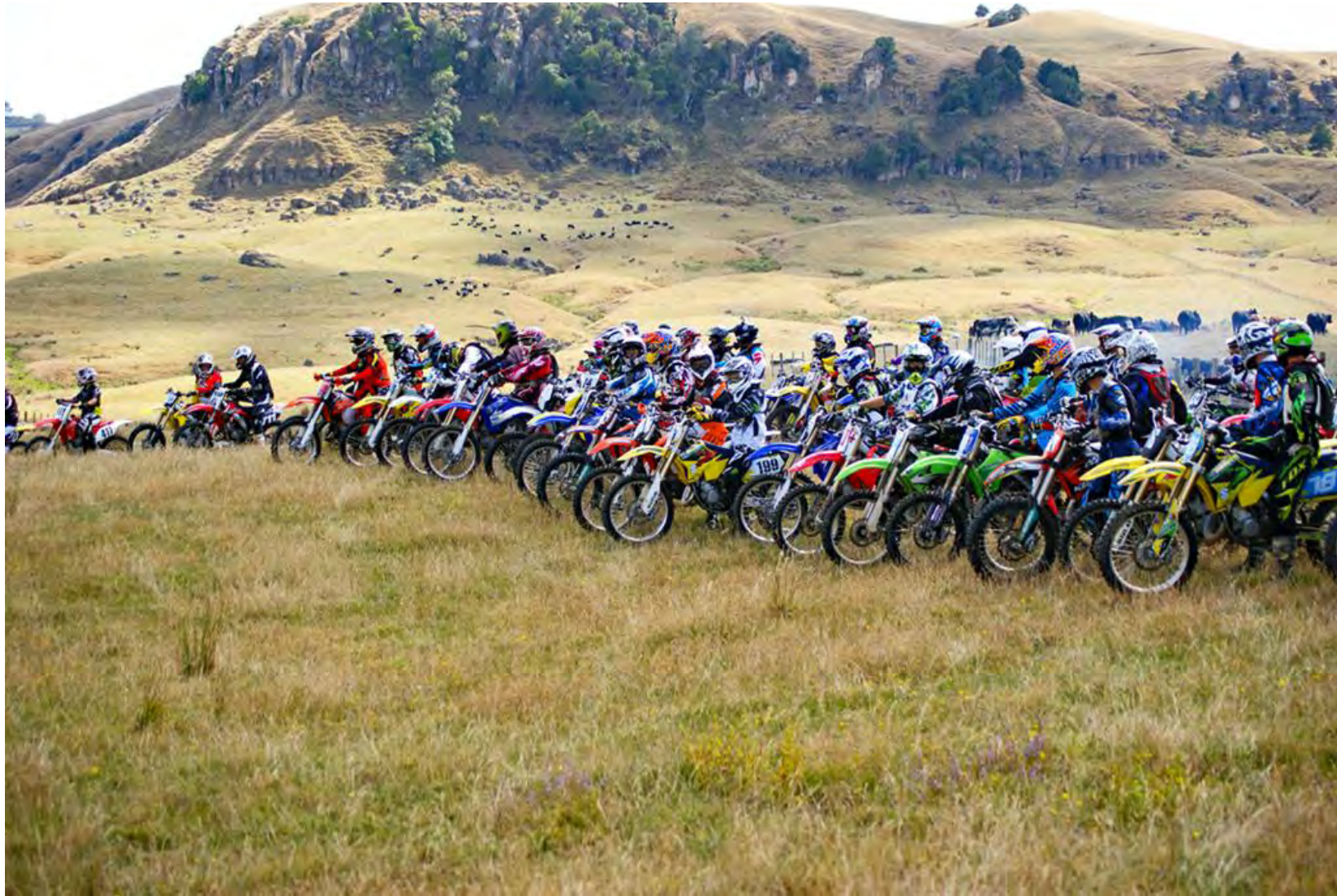
Summary Point 35