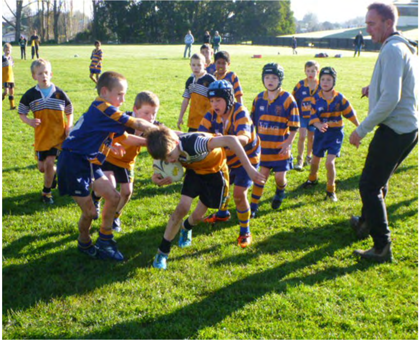
Summary Point 37.1