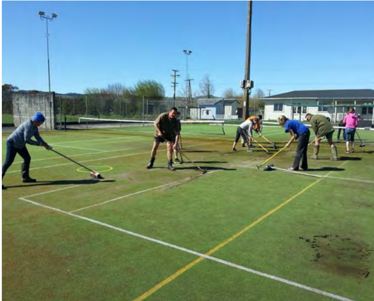
Summary Point 37.1