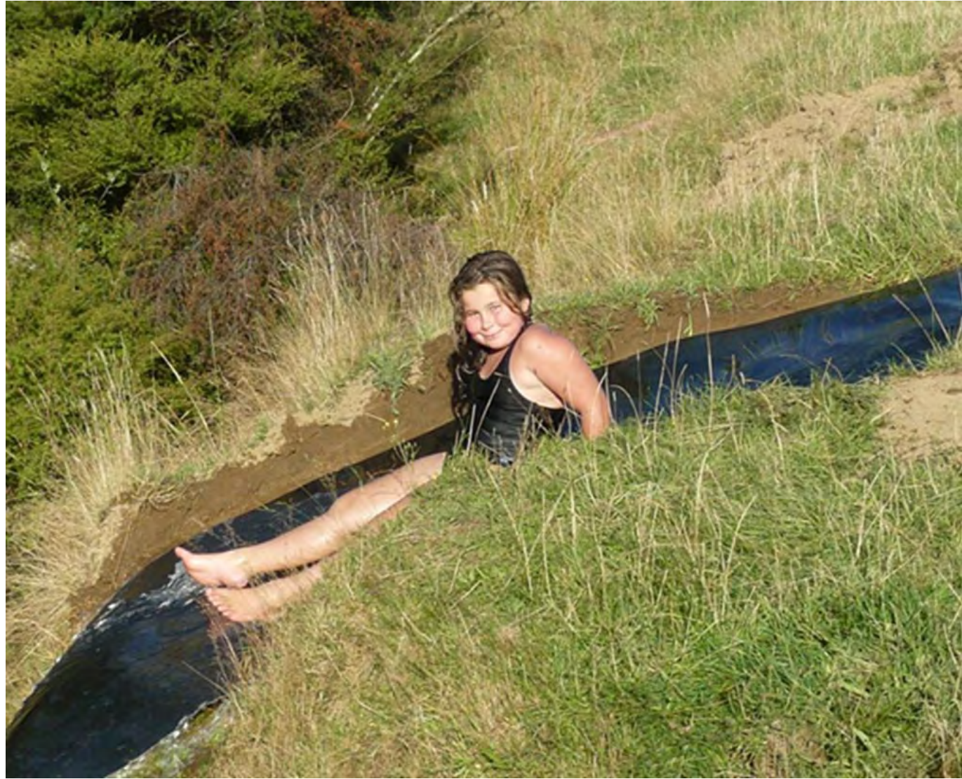
Summary Point 35