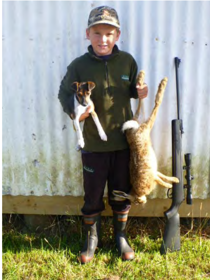
Summary Point 34.3