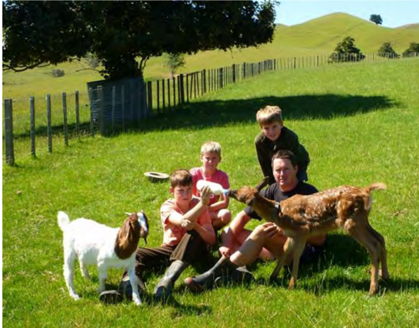
Summary Point 40