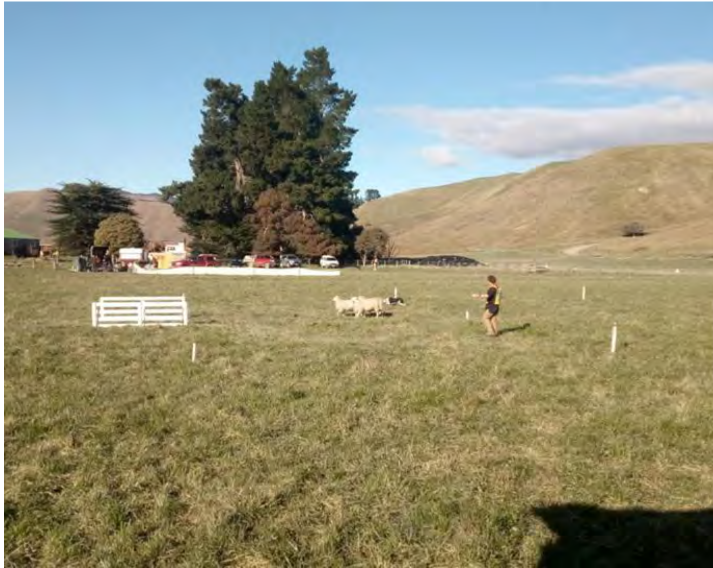
Summary Point 35