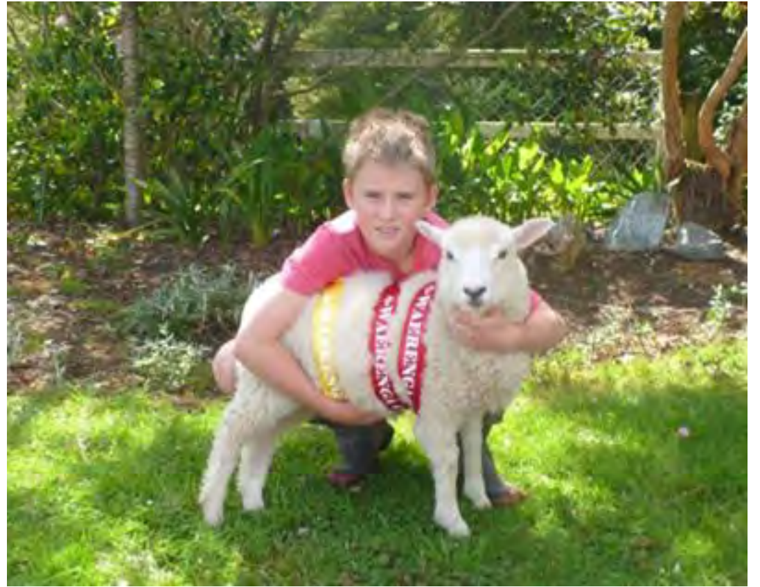
Summary Point 35