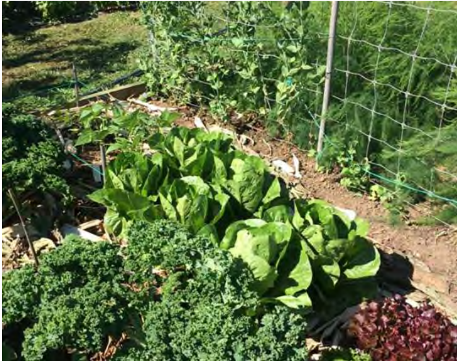
Summary Point 34.3