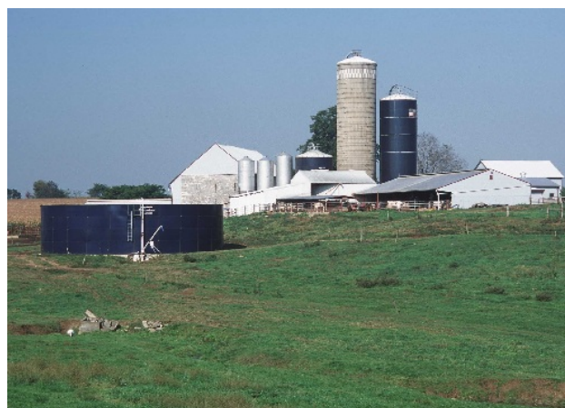
Figure 7: Manure storage, Lancaster, Pennsylvania, USA