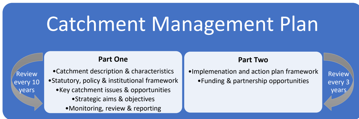
Figure 1: CMP structure