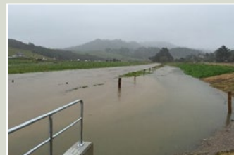
Scheme in flood, 22 September 2016.

Channel maintenance and an all-weather access track along the top of the stopbank was completed in May last year. More recently, a safety grill was installed after we became aware that people were accessing the site. It's a timely reminder that this land is privately owned and people should only be accessing it with the owner's permission.