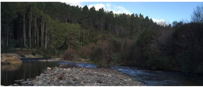
Gravel/vegetation island split the Tairua River resulting in significant erosion.

unaffected by the March/April 2017 flood events. Planned follow up works were completed in November.