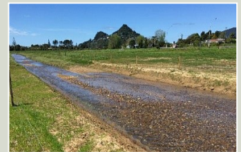
Channel infill in October 2016.